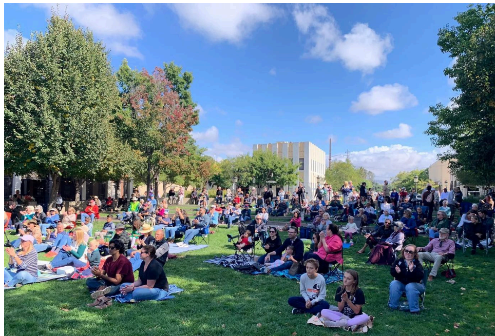
The crowd at Pops on the Green in front of the Bankhead Theater, September 30.