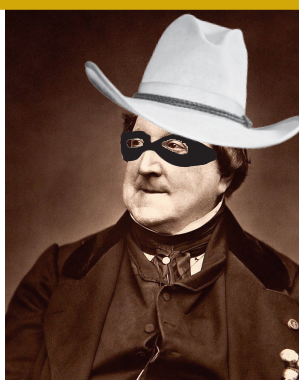
Lone Ranger Rossini

Few composers had more success in their youth than the legendary Gioachino Rossini. His overture to William Tell takes us on a vivid journey from sunrise through a dramatic storm to meet our hero galloping into battle. The famous overture concludes with the most recognizable music of all time, known to many as the theme from The Lone Ranger . Aaron Copland introduces us to a real legend of the American West, Billy the Kid. Copland's evocative music brings together fragments of real cowboy tunes within expansive harmonies that conjure up the western frontier. Come hear these stories and meet the talented winners of our Competition for Young Musicians.