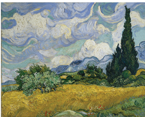
Painting: Vincent Van Gogh, courtesy of the Metropolitan Museum of Art